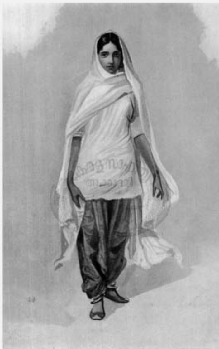
DYER GIRL IN AHMEDABAD